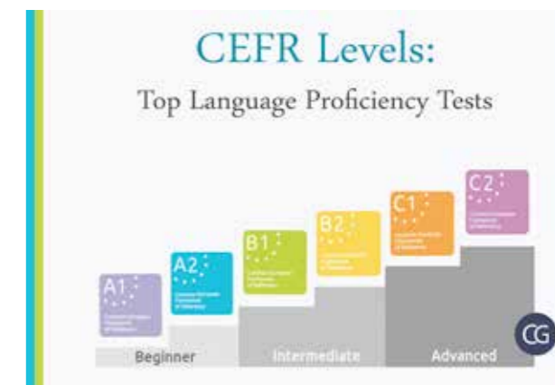
CEFR stands for Common European Framework of Reference. The CEFR levels provide a way of describing a person's language proficiency.

Your class level can change any week when you and your teacher agree you are ready. As a guide, it takes approximately 200 learning hours to progress from one level to the next.